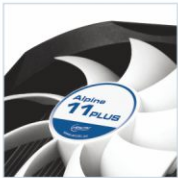
Virtually Silent Fan