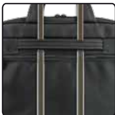
Trolley Strap Trolley Strap