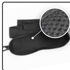
Removable Shoulder Strap Sangle Amovible