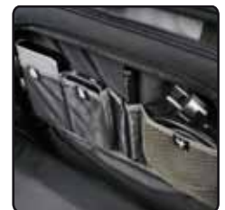
Special Multimedia Accessories Compartment Compartiments dédiés pour accessoires multimédia