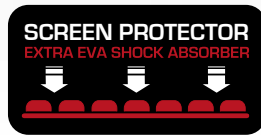
SCREEN PROTECTOR SCREEN PROTECTOR