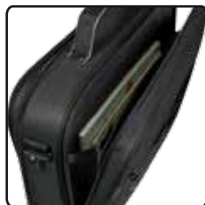
Special Compartments for A4 Documents Compartiments dédiés pour documents A4