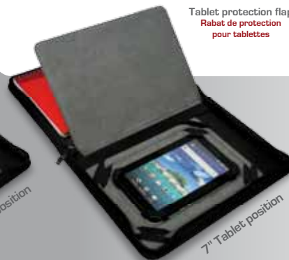
7" Tablet position