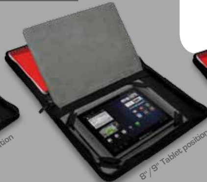
8" / 9" Tablet position