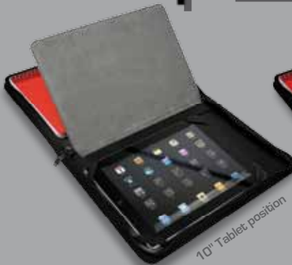
10" Tablet position